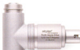
4100-310 Right Angle Drive Synthes® Reamer