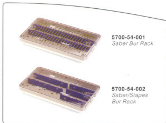
5700-54-001 Saber Bur Rack

A variety of storage units and labels are available for cutting accessory organization.