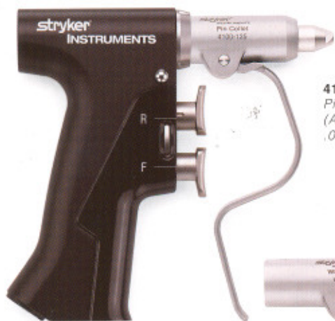
4100-125 Pin Collet (Accepts pins from .078-.125" dia.)