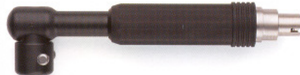
4100-355 Radiolucent Right Angle Drive