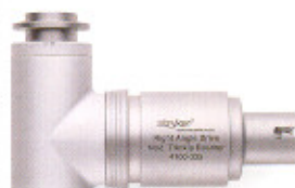
4100-335 Right Angle Drive Modified Trinkle Reamer