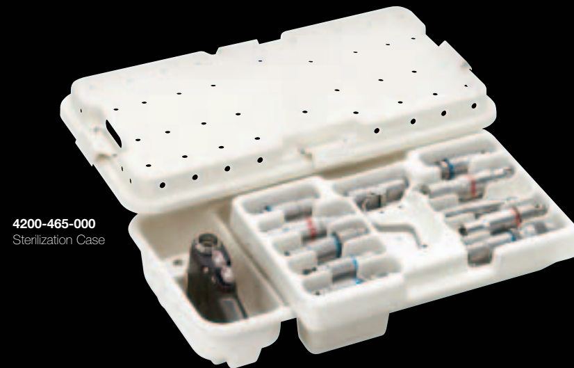
4200-465-000 Sterilization Case