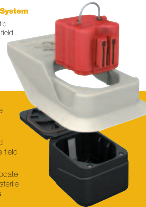
6126-000-000 System 6 Aseptic Battery Kit