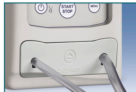
3. Press tubing cassette into FloSteady pump until it “snaps” in. The cassette tubing is now inserted and ready to use.