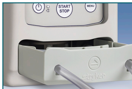
2. Insert disposable cassette tubing into cartridge slot, by placing thumb on the “arrow” & fingers on the grasping handle located at the bottom of the pump.