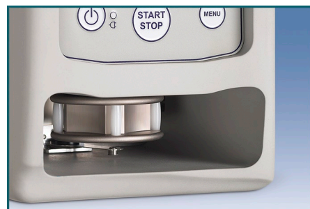
1. Pump cassette slot should be empty before each use.

The FloSteady, Arthroscopy Pump has easy to load cassette tubing. The push-lock cassette tubing and ergonomic grasping handle, available at the bottom of the pump, allow for easy, single-handed tube set insertion. The cassette tubing is intuitive and reduces valuable OR preparation time.