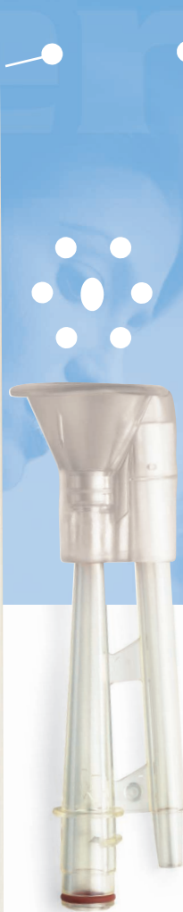
210-14 High Flow Tip