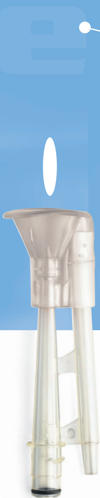
210-10 Bone Cleaning Tip