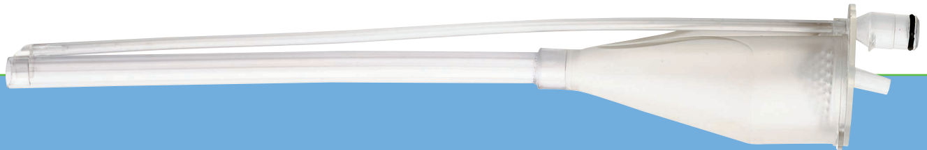
210-4 Femoral Canal Brush

Variety of specially engineered tips for the individual orthopedic needs.