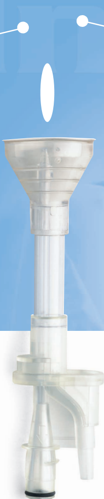
210-10-100 Coaxial Bone Cleaning Tip with Pliable Splash Shield