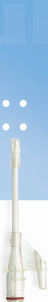
210-16 Irrigation Only Tip