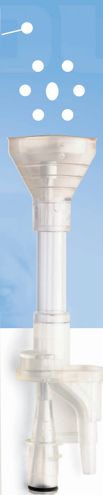
210-14-100 Coaxial High Flow Tip with Pliable Splash Shield