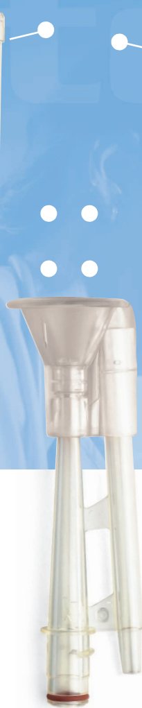
210-12 Soft Tissue Tip