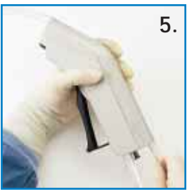
Pinch new tubing and press into channel on top rear of the handpiece. Pull tubing forward and down handpiece firmly. Pull tubing to the rear or cut so tubing is flush with distal end of handpiece.