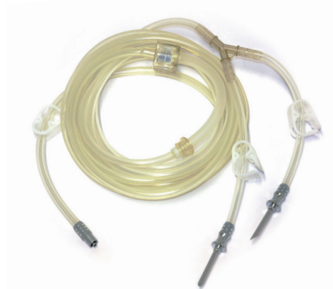
Tube set with Spike and Luer-Lock connector male, reusable, only inflow, 20 uses, transponder protection*