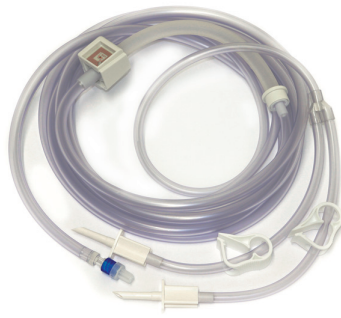
Tube set with Spike and Luer-Lock connector male, disposable, only Inflow, transponder protection