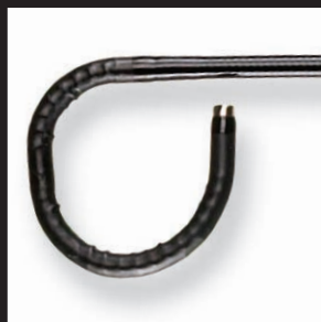
Dual Deflection Down